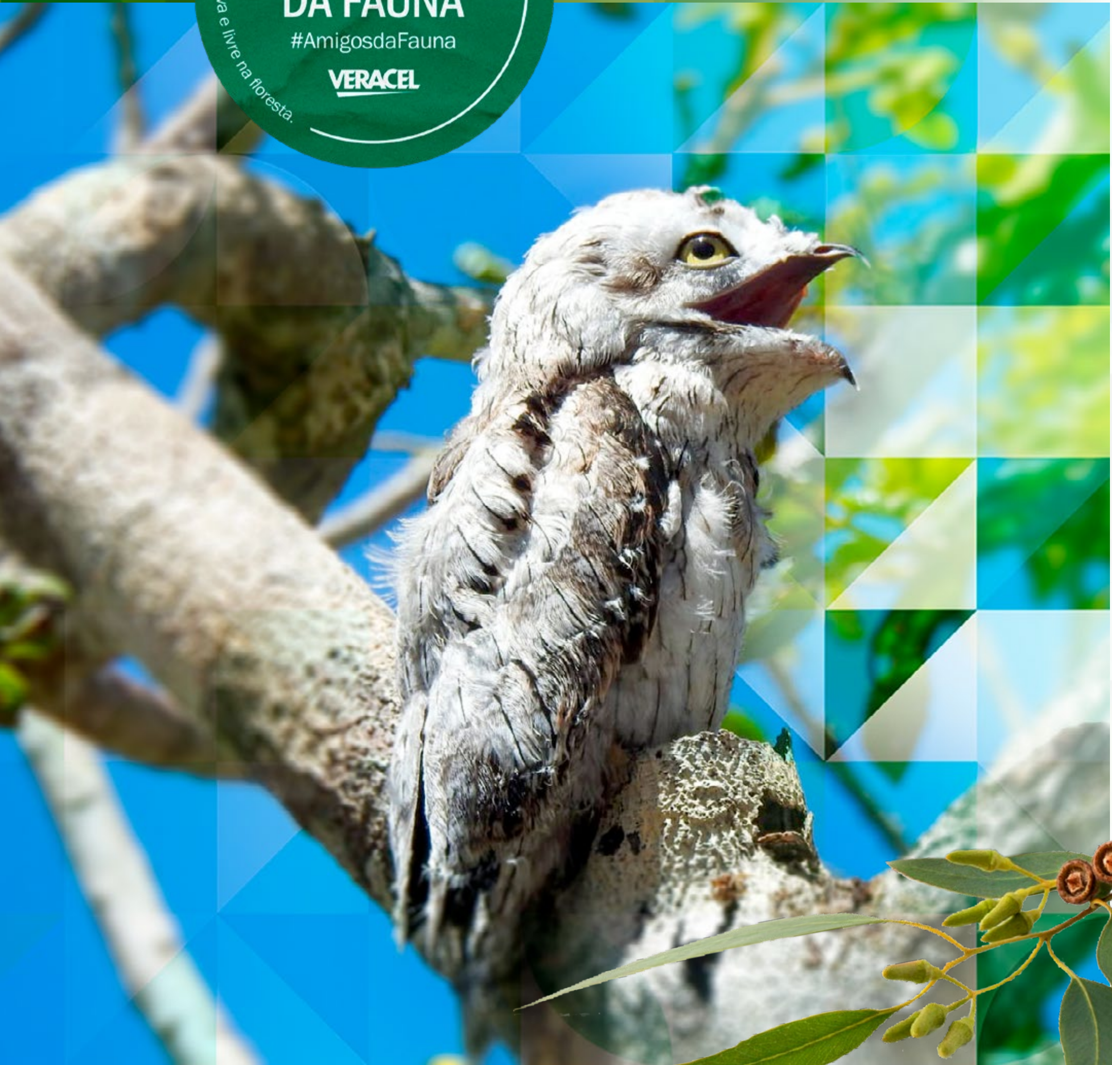
• Common potoo (Nyctibius griseus)