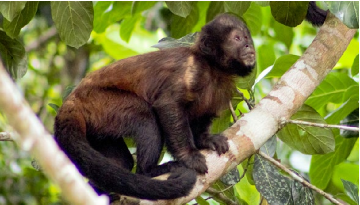
• Crested capuchin (Sapajus robustus)