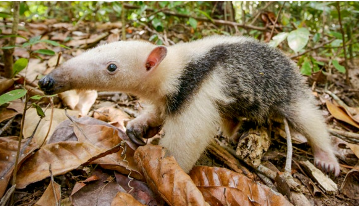
• Lesser anteater (Tamandua tetradactyla).